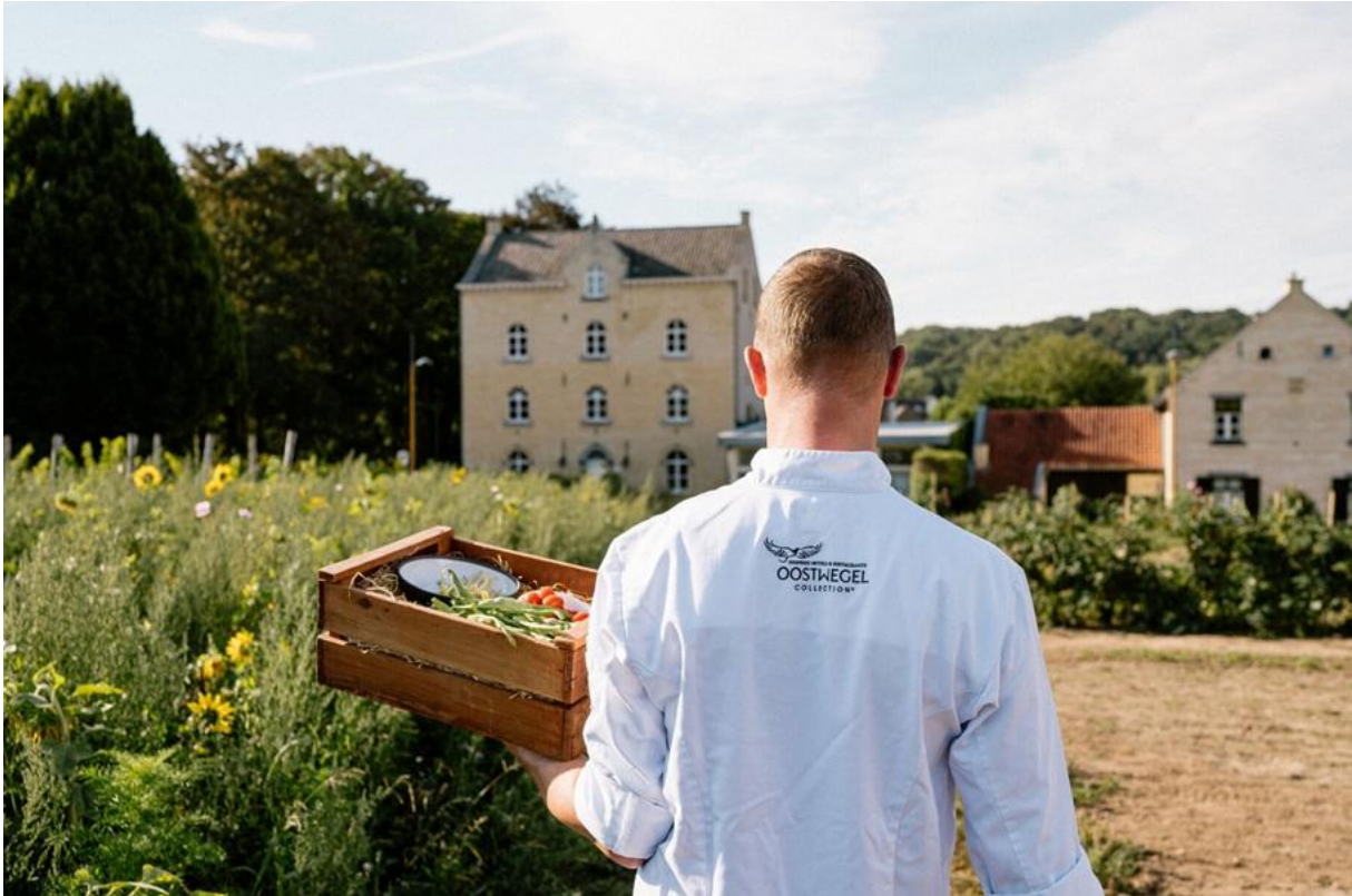
Oostwegel Collection certified as B Corp